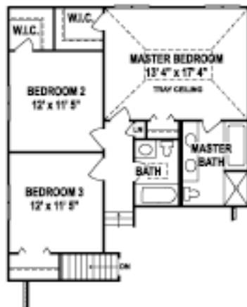
optional upper level